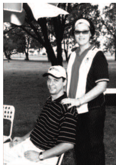
At the "Oasis" – situated between the 14th and 16th hole